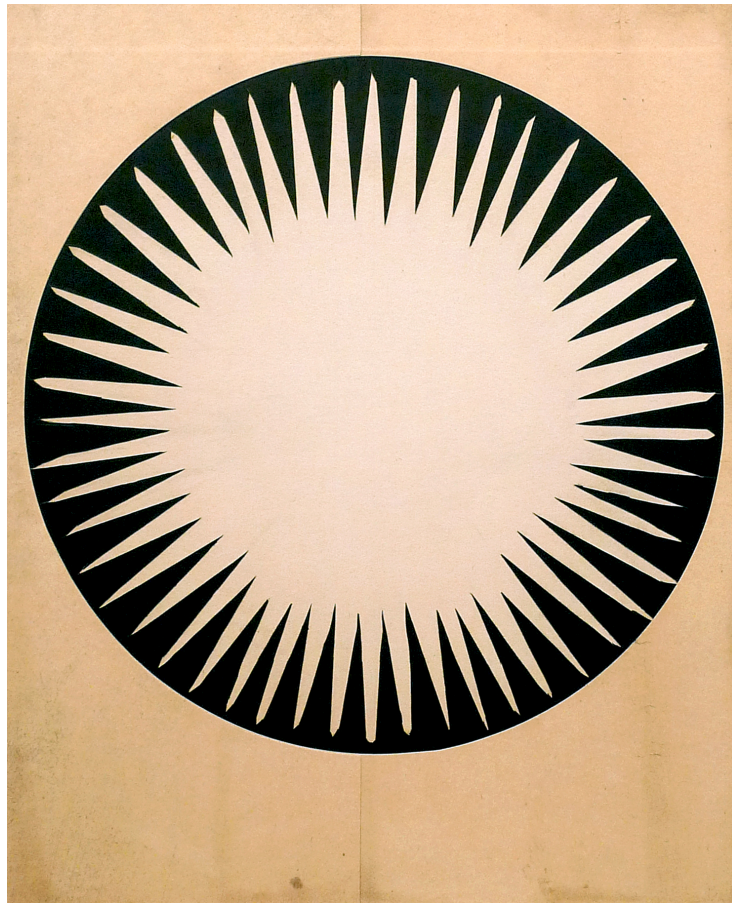
Robert Kelly, Voz de Dios I , 2022, Mixed media on board, 17 x 14 inches

41 East 57 th Street • New York 10022, 11 th floor • 212.319.1996 • www.jasonmccoyinc.com